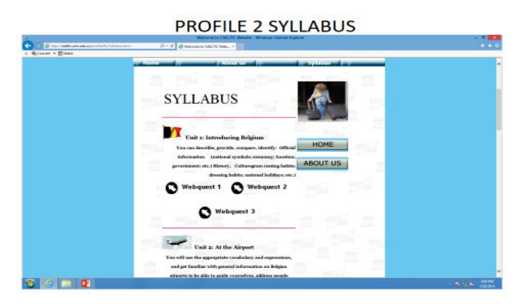
Figure 2 Profile 2 Syllabus through Webquests

Methodology: Communicative Language Teaching using task-based approach through WebQuests. All the units were designed in WebQuests templates. (see figure 2)